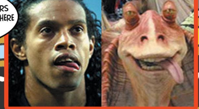
JAR JAR BINKS FROM STAR WARS